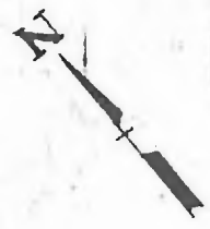
FLOOR PLAN. SCALE 1/16" = 1'0"