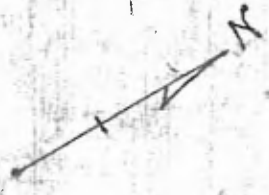
FLOOR PLAN. SCALE 1/8" = 1'-0"