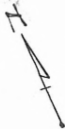
FLOOR PLAN. SCALE 1/16" = 1'-0"