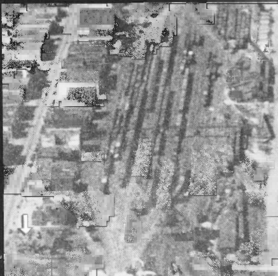
North Classification Yards, Springfield, MO, looking west, December, 1946. Arrow indicates old CTC building, now the home of The Frisco Railroad Museum Inc.