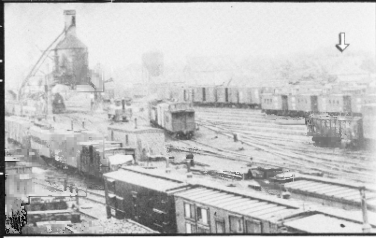
North Classification Yards, Springfield, MO, looking southeast, December, 1946. Arrow indicates old CTC building, now the home of The Frisco Railroad Museum Inc.