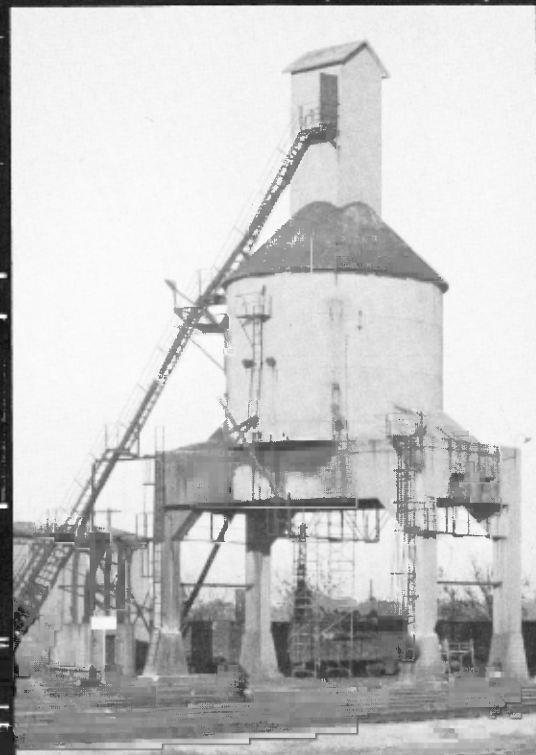
North Classification Yards, May 22, 1948. Arrow indicates location.